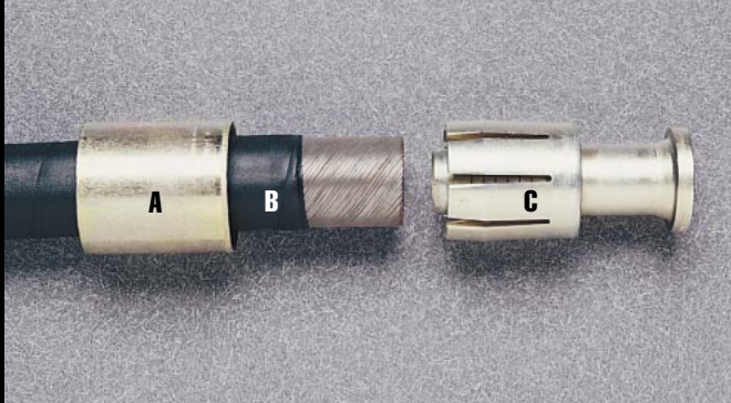
A - Sleeve B - Hose C - Stem

Cat reusable couplings for XT Hose feature an exclusive design that reduces your biggest hose repair expense.