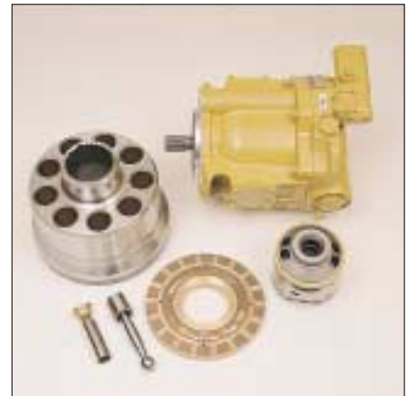
Cat Reman hydraulic products offer same-as-new quality at fraction-of-new prices.